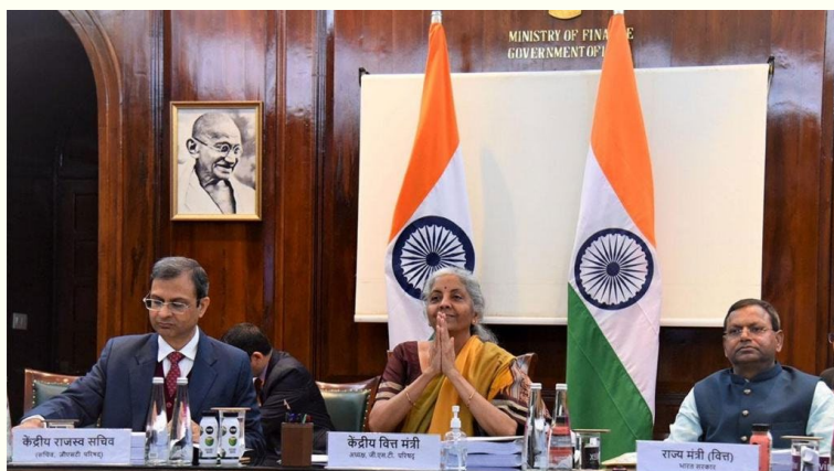
Smt. Nirmala Sitharaman Chaired the 48 th meeting of the GST council via virtual mode

The meeting concluded with a slew of reforms and recommendations by the GST Council such as decriminalising certain offences under section 132 of the CGST Act and raising the minimum threshold of tax amount for initiating prosecution under GST from Rs. One Crore to Rs. Two Crores. In the absence of existing rules of filing refund applications by unregistered buyers, the Council recommended the amendment of CGST Rules (2017) along with issuance of a circular prescribing the procedure for filing a refund application by unregistered buyers in cases where the contract/ agreement for supply of services is cancelled and time period of issuance of credit note by the concerned supplier is over.