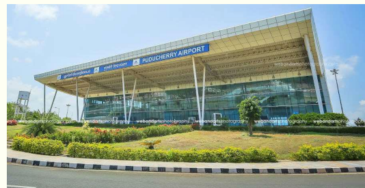
Puducherry Airport Expansion Project proposed by the Government of Puducherry

The modernization of the airport is proposed in two phases with an overall cost of Rs. 2,500 Crs.. IFS has been providing handholding support to Govt. of Puducherry in the proposed expansion.