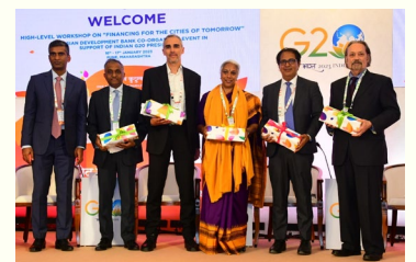
JS (IPP) represented Indian Presidency at 1 st IWG meeting

IFS is the nodal body for Infrastructure Working Group (IWG) under the Finance Track of G20 India Presidency. The first meeting of the IWG was organized in Pune, Maharashtra during 16 th -17 th Jan, 2023 under the chairmanship of Joint Secretary (IPP), DEA, MoF to undertake discussions around the flagship theme – "Financing Cities of Tomorrow-Inclusive, Resilient and Sustainable". The meeting witnessed active participation from G20 member countries, guest countries and international organizations. The next IWG meeting