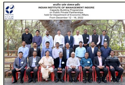
Group photographs of Participants from trainings at NLSIU, IIM Calcutta and IIM Indore