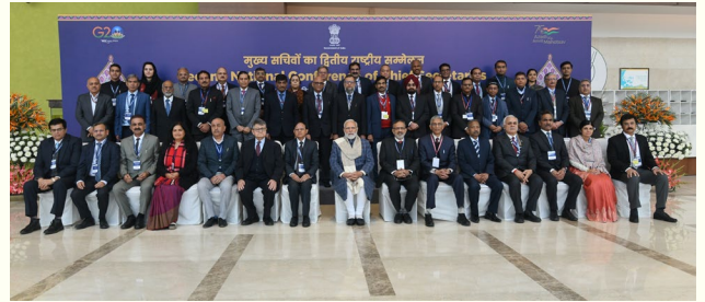
Second National Conference of Chief Secretaries chaired by Hon'ble Prime Minister, Shri Narendra Modi

The second National Conference of Chief Secretaries, held from 5 th to 7 th January 2023 at New Delhi, was chaired by Hon'ble Prime Minister, Shri Narendra Modi. The outline of this year's conference was "Growth and Job Creation", divided into 6 sub-themes namely – Thrust on MSMEs, Infrastructure and Investments, Minimizing Compliances, Women's Empowerment, Health and Nutrition, and Skill Development. IFS, DEA was the nodal Central department for deliberations around Pillar-1 on 'Growth and Job Creation.'