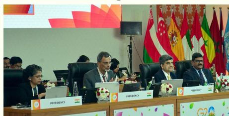
Secretary Economic Affairs & CEA represented India at 1 st FCBD meeting